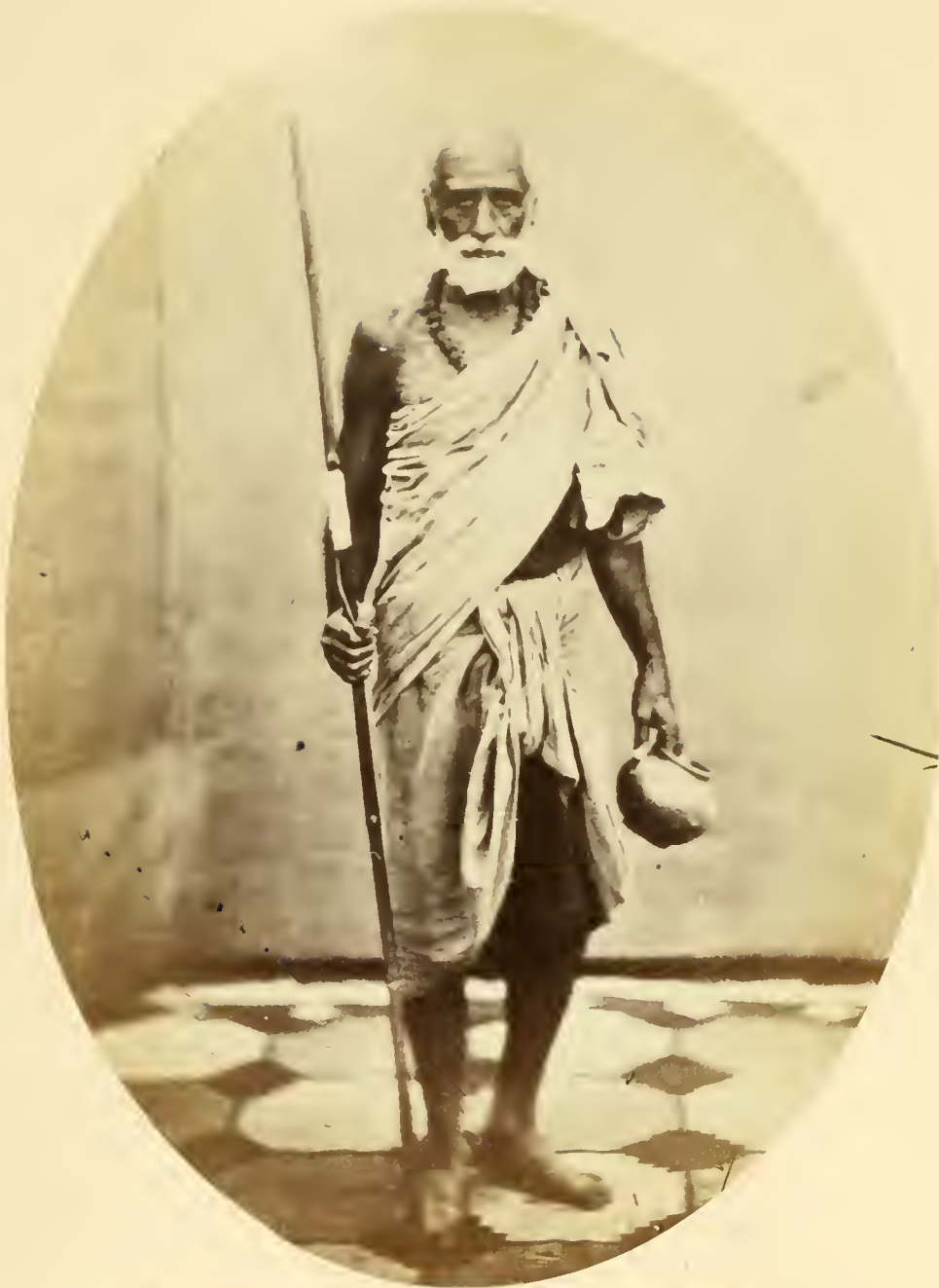
DUNDEE. HINDOO DEVOTEE. BENARES.