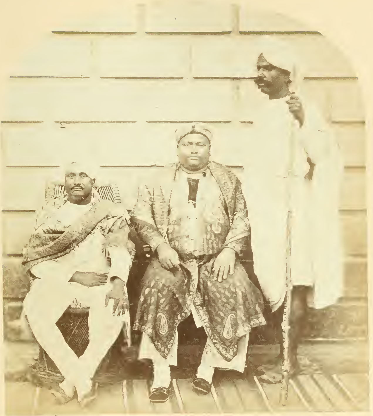
BUJGOTEES. RAJPOOT TRIBE—HINDOOS. OUDE.