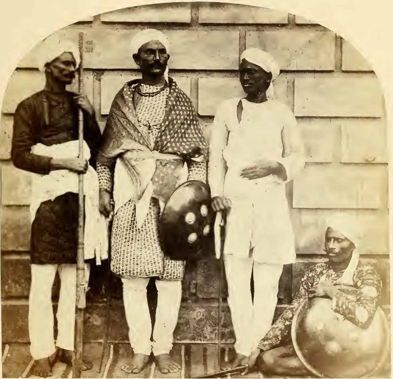
BAIS. RAJPOOT TRIBE—HINDOOS. OUDE. (78)