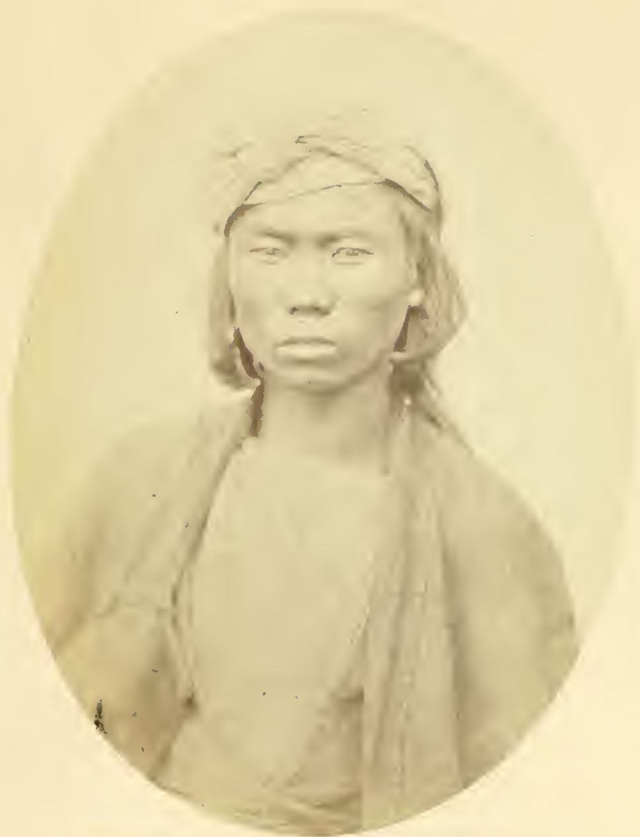
SUNWAR. (SUB-HIMALAYAN ORIGIN).