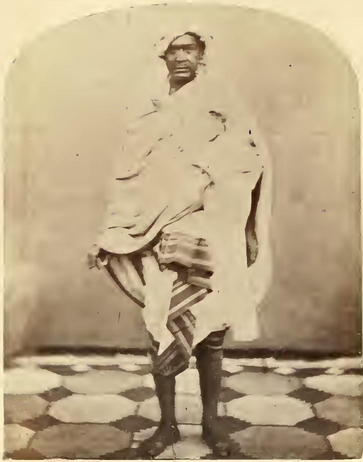
GUNGAPOOTREE. HINDOO WORSHIPPER OF GANGES. BENARES.