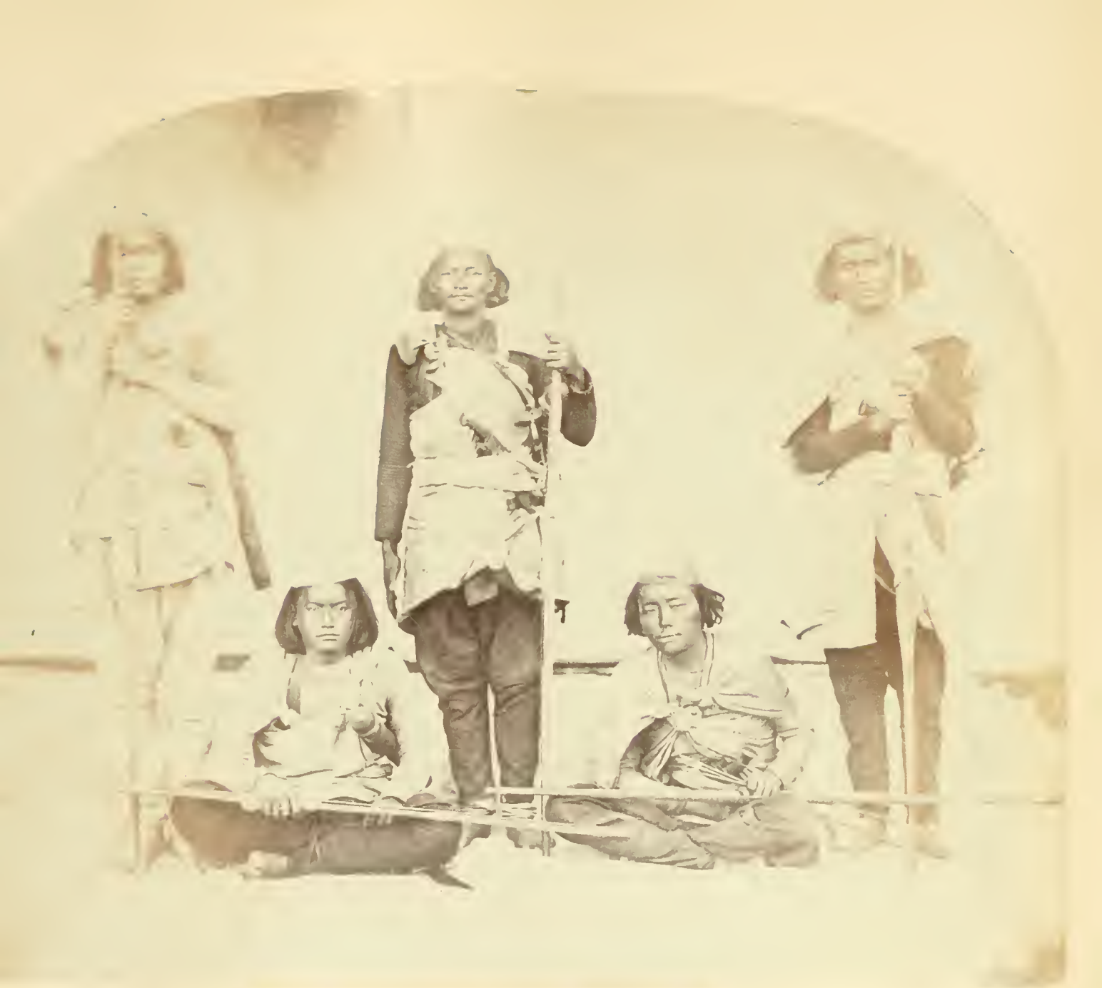
LIMBOO GROUP. ABORIGINAL—TRANS-HIMALAYAN. NIPAL. (64)