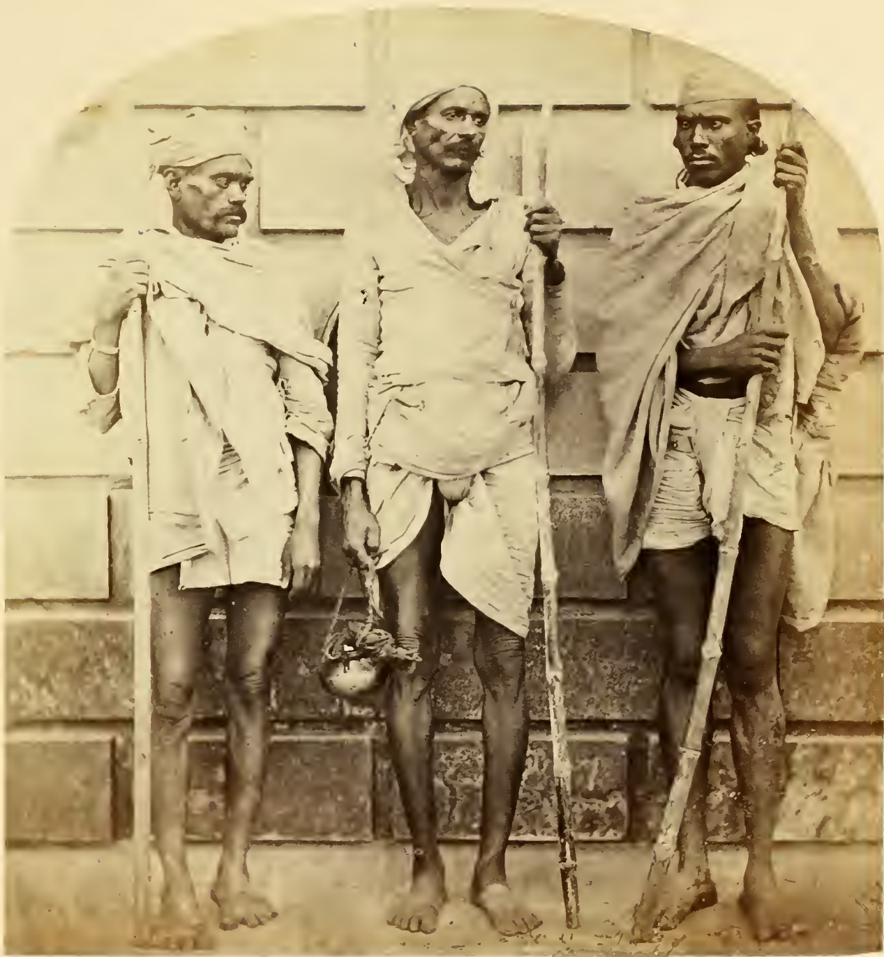
BHURS. SUPPOSED ABORIGINAL. OUDE. (84)