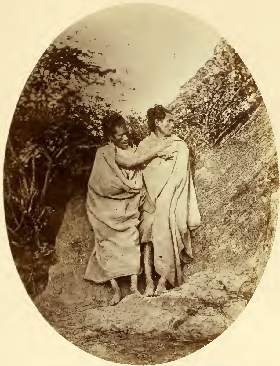
MEECH GROUP. (TRANS-HIMALAYAN ORIGIN). DARJEELING.