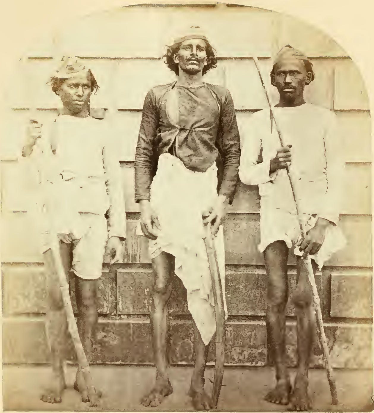
PASEES. LOW CASTE HINDOOS. OUDE.