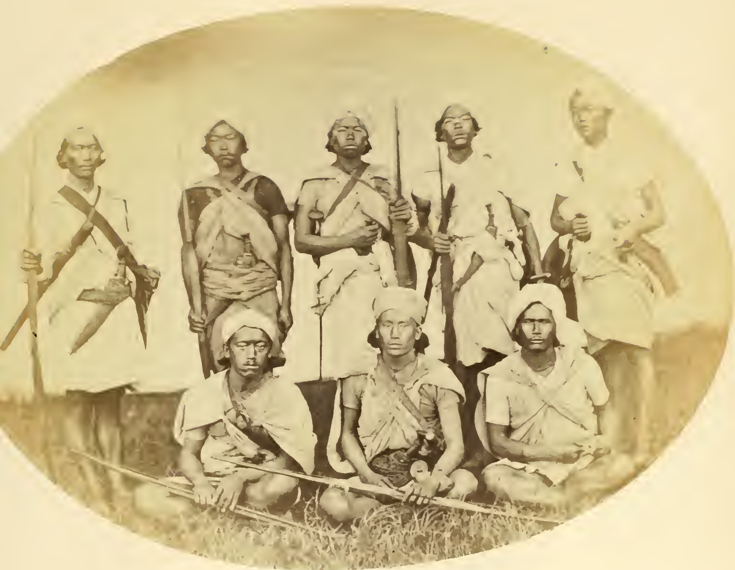
MAGAR GROUP. MILITARY TRIBE.