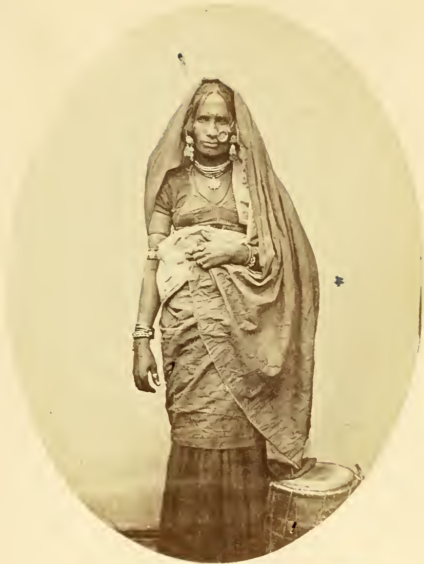
GWAL NUT. HINDOO: NUT TRIBE. MORADABAD.