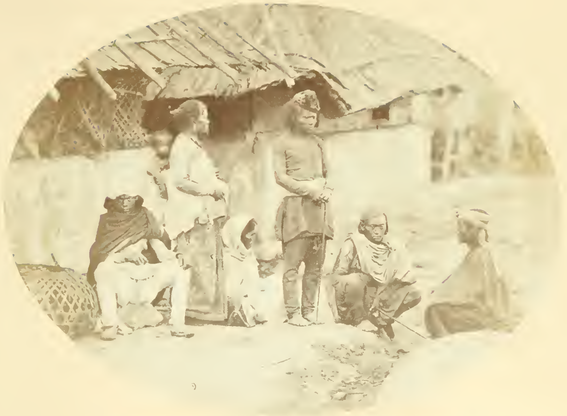
SUNWAR FAMILY. (SUB-HIMALAYAN ORIGIN.)