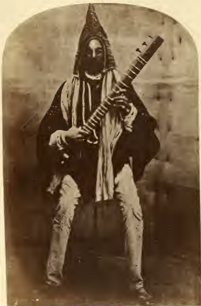
BHAT. WANDERING MINSTREL. BENARES.