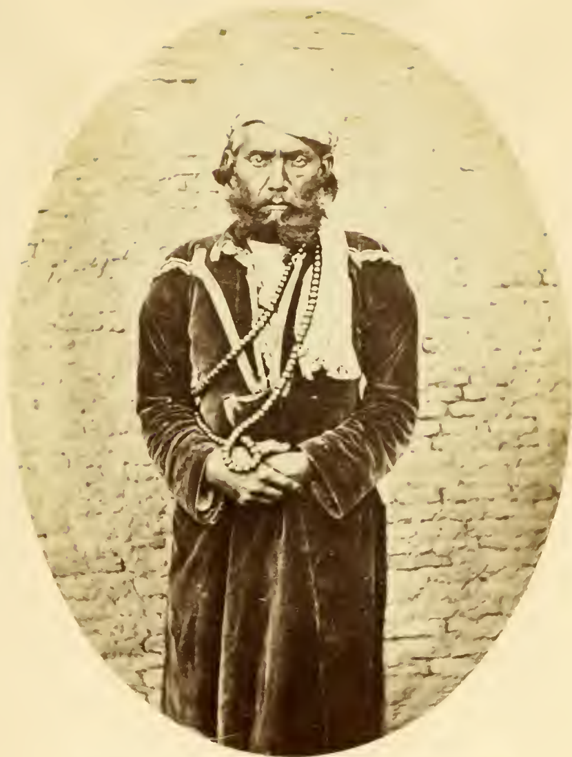
BHAT. WANDERING MINSTREL. MAHOMEDAN. MORADABAD.