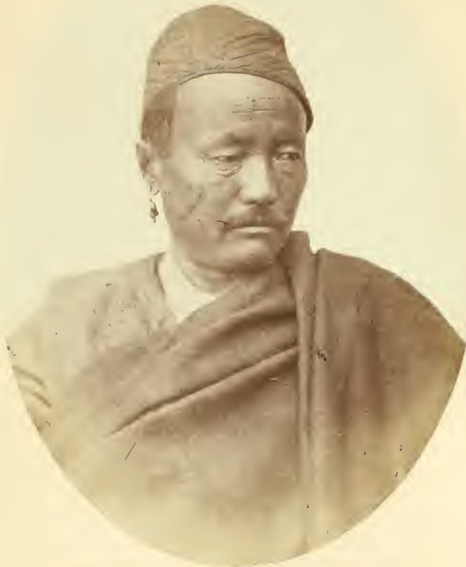
LIMBOO. ABORIGINAL—TRANS-HIMALAYAN. NIPAL.