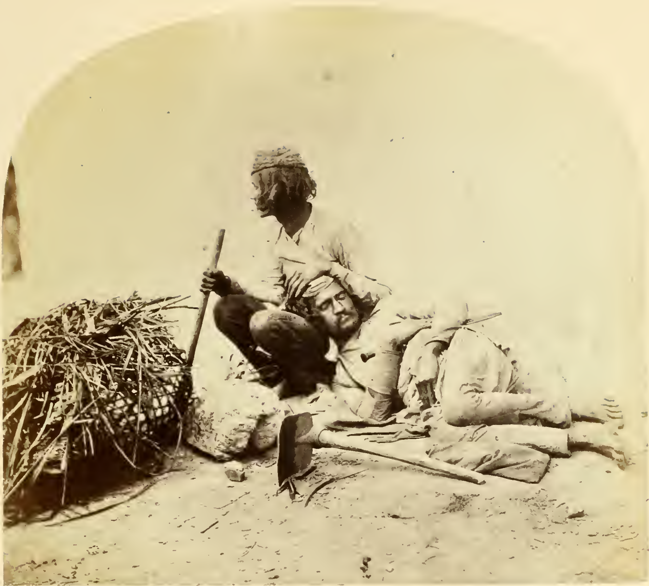
KHAS OR KUS GROUP. GOORKHA-DOMINANT TRIBE.