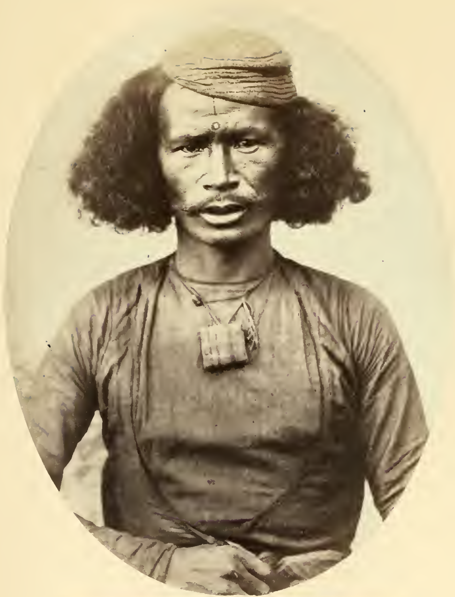
GOORUNG. MILITARY TRIBE. NIPAL. (67)