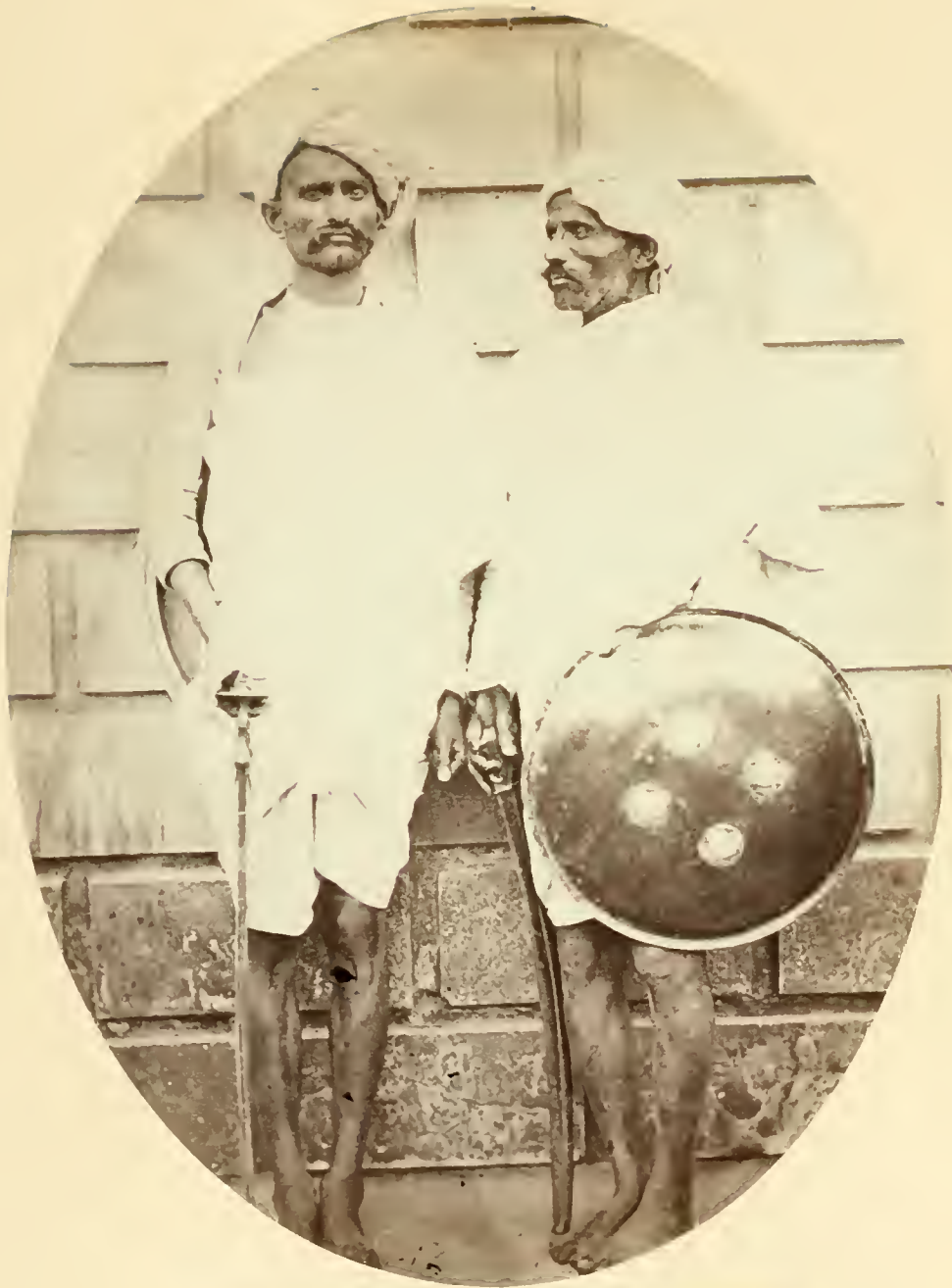
GURGBUNSEES. RAJPOOT TRIBE—HINDOOS. OUDE.