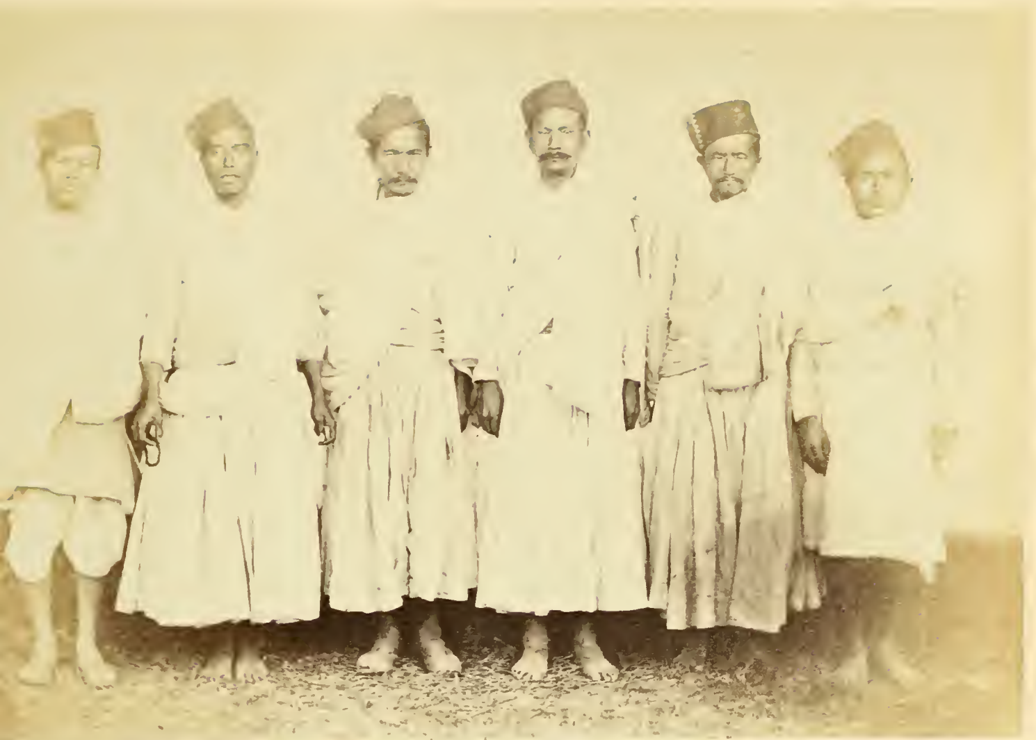
BANRAS. SUBDIVISION OF NEWARS. NIPAL. ( 74 )

1875 1876 1877 1878 1879 1880 1881 1882 1883 1884 1885 1886 1887 1888 1889 1890 1891 1892 1893 1894 1895 1896 1897 1898 1899 1900