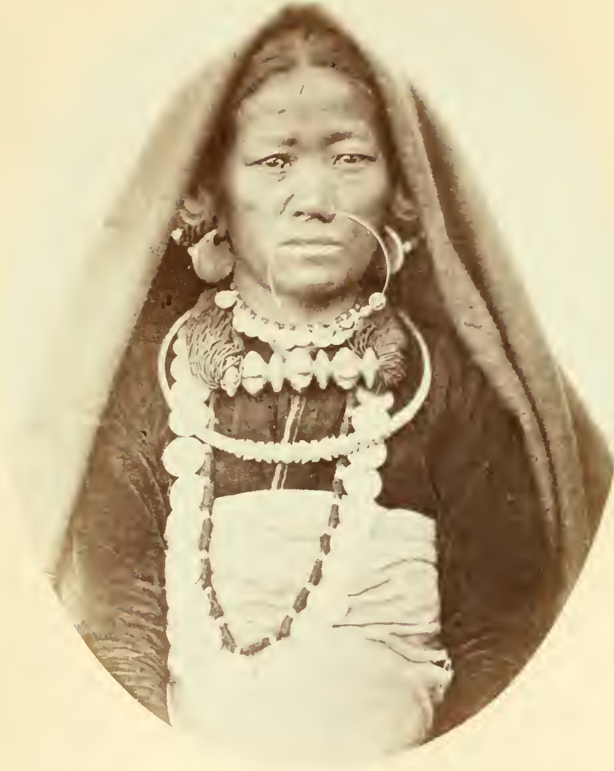
LIMBOO FEMALE. ABORIGINAL—TRANS-HIMALAYAN.