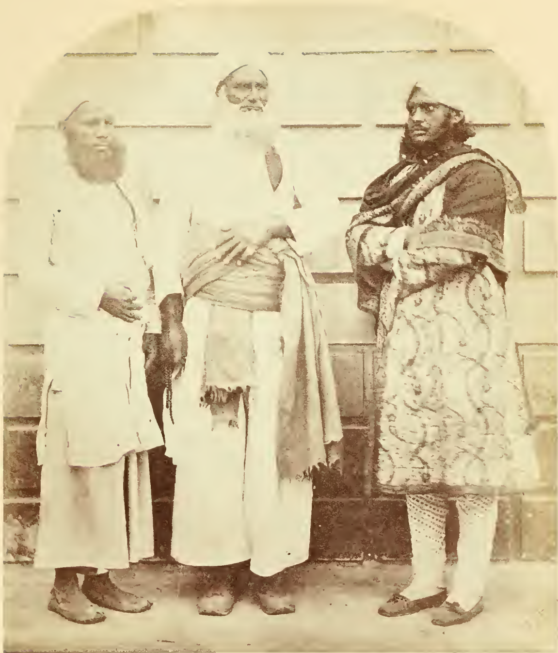
PATHANS. MAHOMEDAN. OUDE.