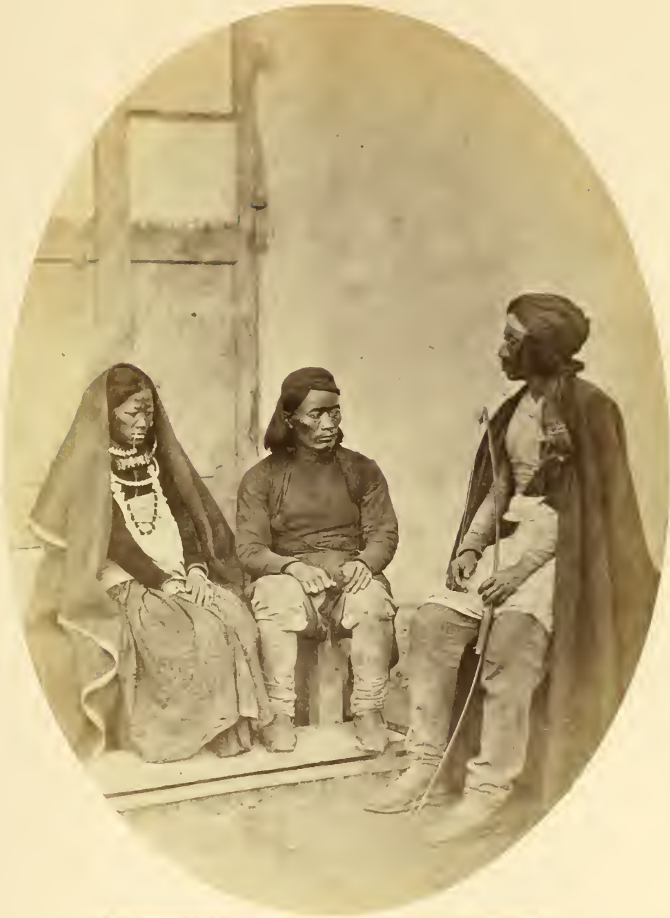
LIMBOO GROUP. ABORIGINAL—TRANS-HIMALAYAN.