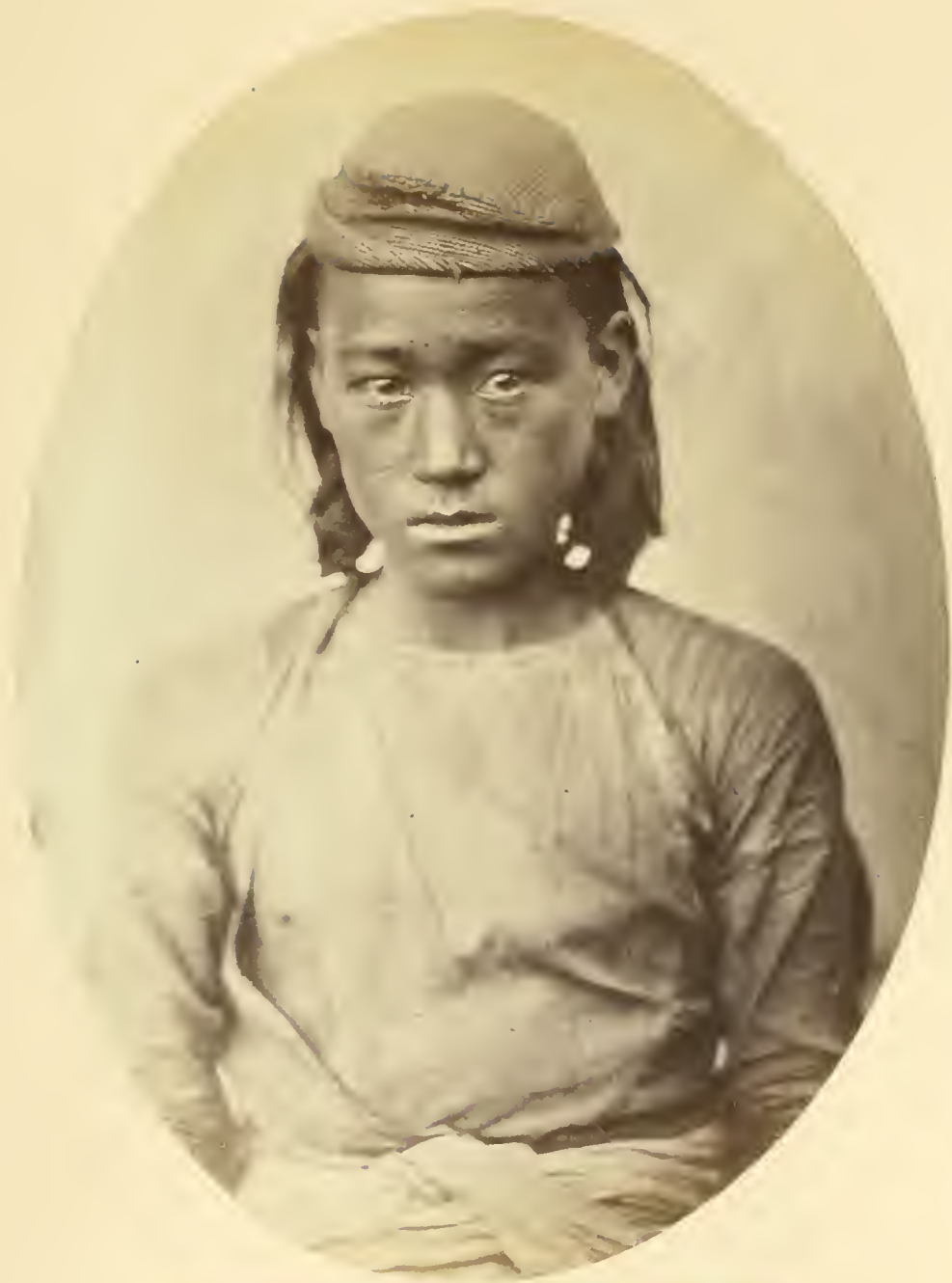
NEWAR OR NIWAR. SLAVE POPULATION. SUPPOSED ABORIGINAL. NIPAL.