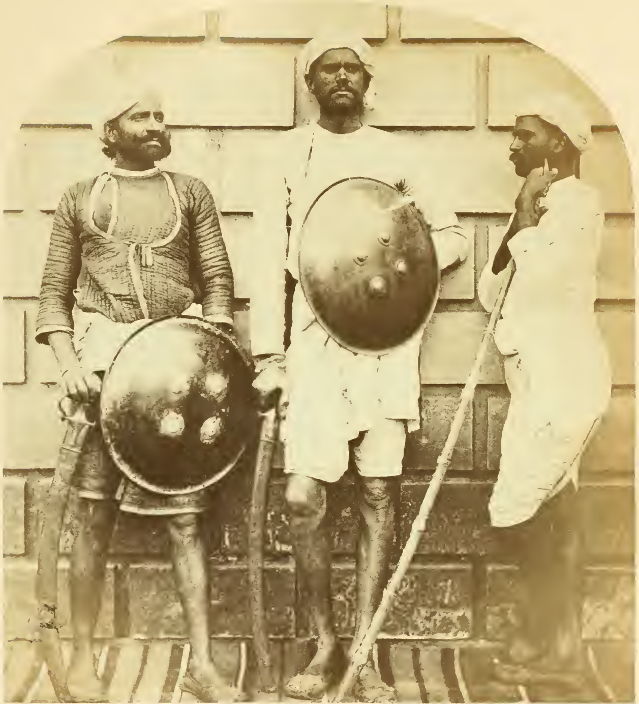
BHALI SOOLTANS. MOSTLY MAHOMEDANS.