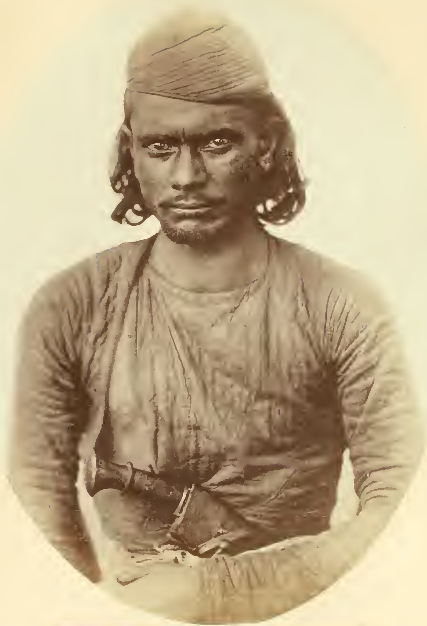
KUS OR KHAS. GOORKHA-DOMINANT TRIBE. NIPAL. (70)