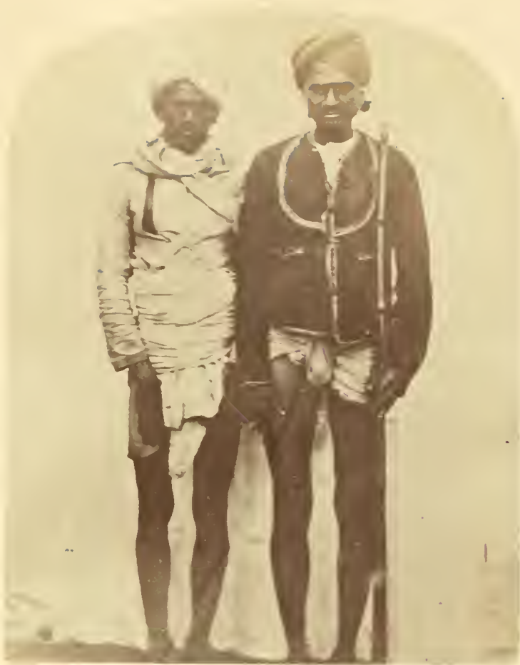
BHUR. ABORIGINAL TRIBE. BENARES DISTRICT.