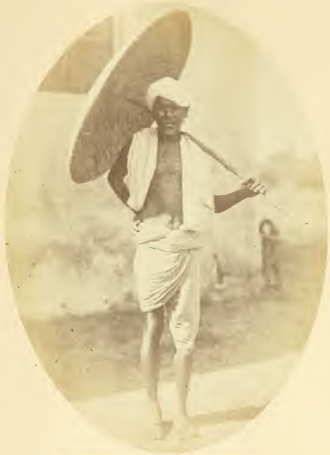
MIRZAPORE HILLMAN. SUPPOSED ABORIGINAL. MIRZAPORE.