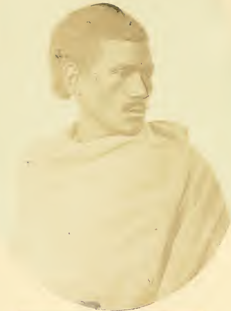
MEECH. (TRANS-HIMALAYAN ORIGIN). DARJEELING.