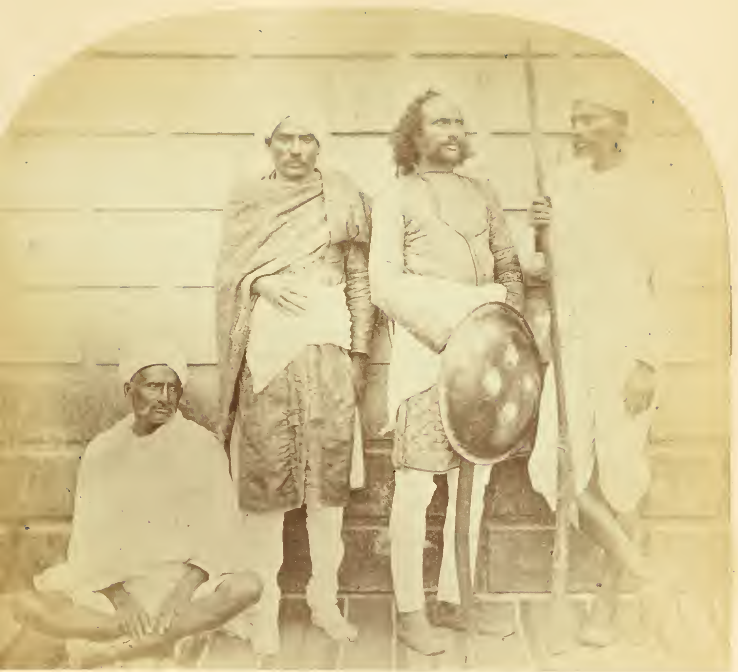
RAJKOOMARS. RAJPOOT TRIBE—HINDOOS.