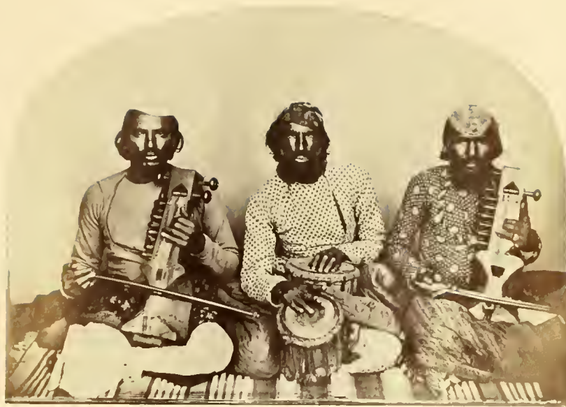
MIRASSEES. MAHOMEDAN. MINSTRELS. MORADABAD.