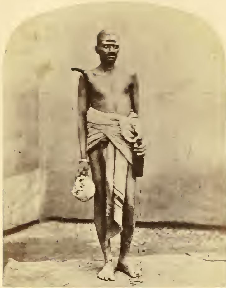
AGHOREE. HINDOO MENDICANT. BENARES.