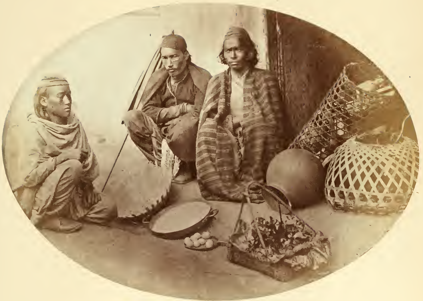
NEWAR GROUP. SLAVE POPULATION. SUPPOSED ABORIGINAL. NIPAL. (73)